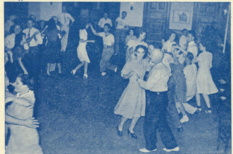
UAW-CIO WORKERS RELAX