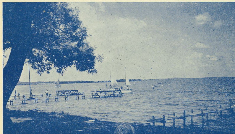
SUNSET ON LAKE MENDOTA

This Labor Institute is sponsored by the Regional Directors of Region 3 and 4, and by the International Education Department. The complete faculty will be supplied by the UAW-CIO.